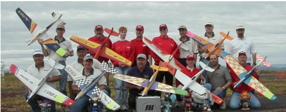
JR Gold Cup #1 Top 10, Phoenix, AZ, Feb 2001