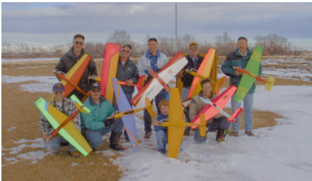
More winter racing in District 3, Calgary, Alberta