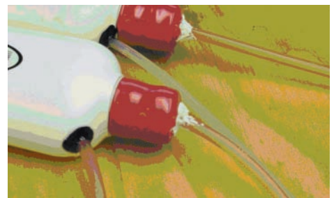
Adhesive heat shrink tubing applied over bottle neck and silicone applied