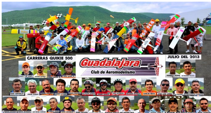
Q500 Group Picture