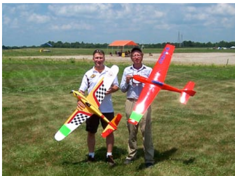
Team "Ground Pounders" left their mark at the NATS.