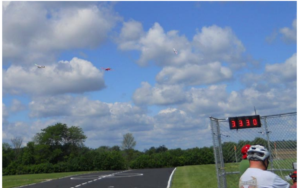
Three EF-1's on lap three very close together