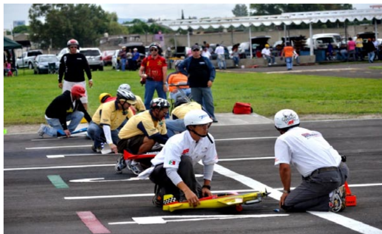
Sunday Q40 Racing day