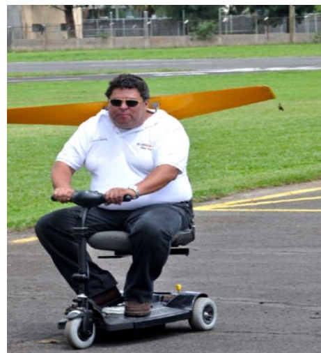
We're working on a new pylon class event...